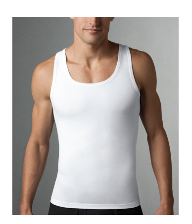
Tank (Style # 611) $55