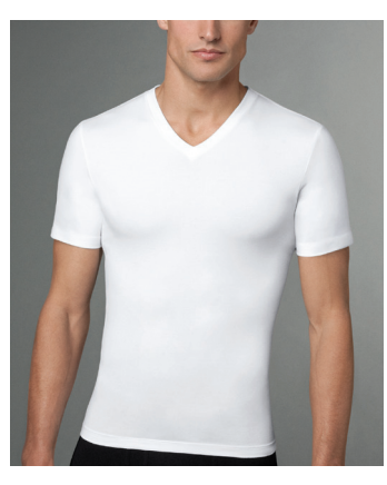
V-Neck (Style # 610) $58